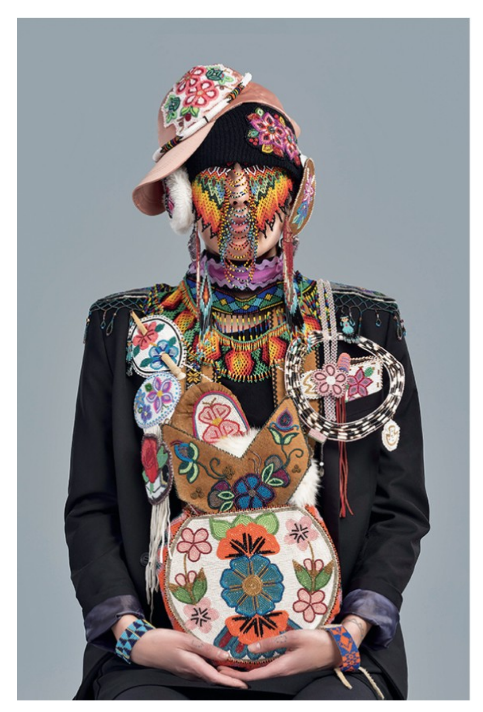
Dana Claxton, Headdress-Jeneen, 2018, LED firebox with transmounted chromogenic transparency. Collection of Cathy Zuo.