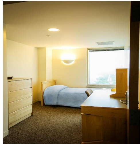
(Right) photo of bedroom space in 10 Buick Street apartment