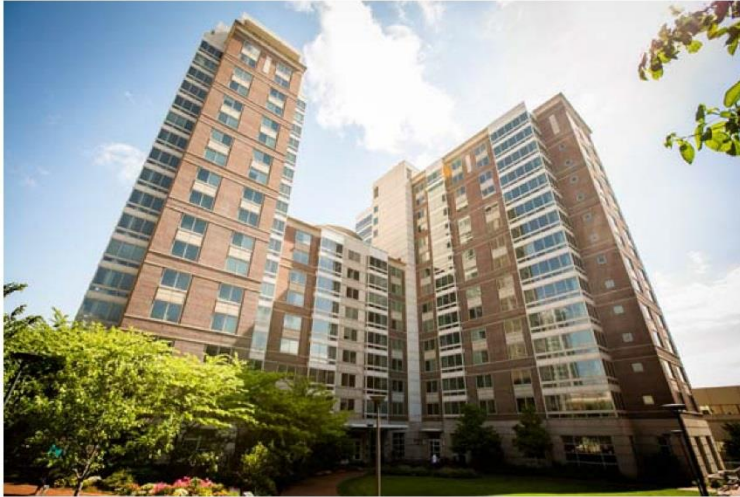
(Left) Photo of the exterior of 10 Buick Street.