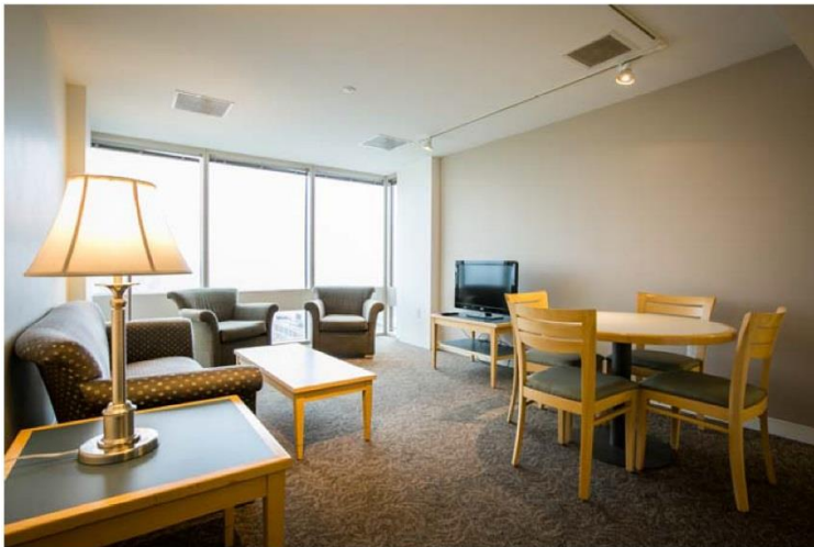
(Above) photo of common living space in 10 Buick Street apartment.