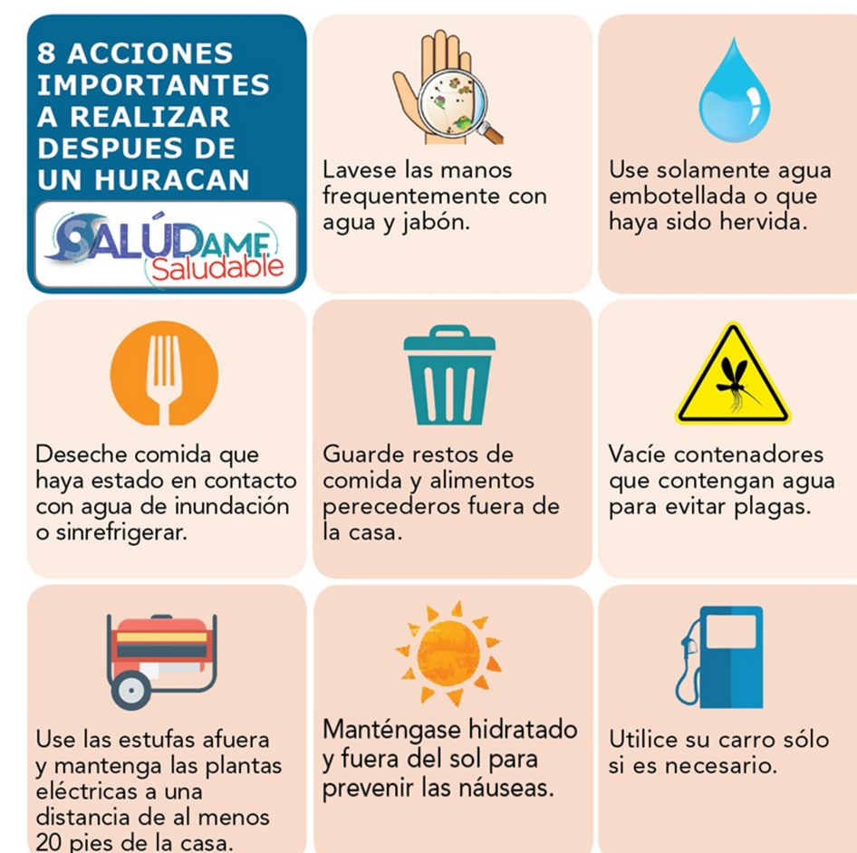
Figure 3. Sample Element of Public Health Campaign

Conclusion: Relative to centralized funding approaches, strong SME Network with Local Partner can generate quick outcomes in a cost-effective manner