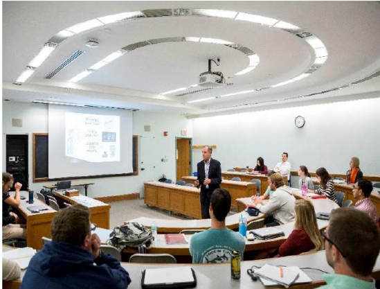
In the Classroom