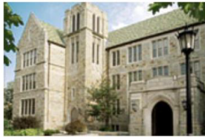
CARROLL SCHOOL OF MANAGEMENT