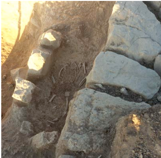
Fig. 3. Infant burial in situ. Note cracked wall stones, indicative of fierce burning.