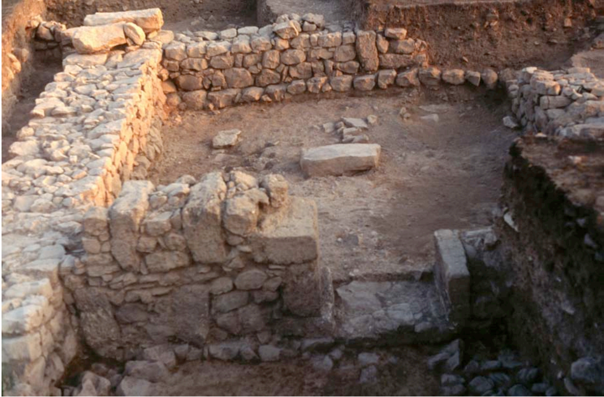
Fig. 2. View of the northernmost room of the three-room Archive complex, looking north. The burial was found up against the north wall, directly across from the doorway, slightly above floor level.