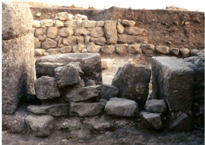
Fig. 4. Blocked doorway into the room, as found.