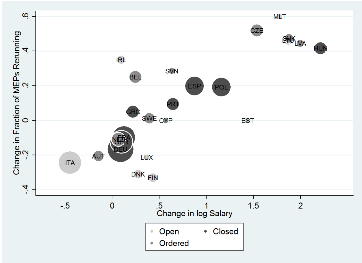
Figure 1: The impact of salary change on MEPs' willingness to run for reelection

Closed, ordered, and open refer to the type of electoral system. The size of the circles is proportional to the number of MEPs from the country. Countries are labeled with their ISO codes: Austria (AUT), Belgium (BEL), Cyprus (CYP), Czech Republic (CZE), Denmark (DNK), Estonia (EST), Finland (FIN), France (FRA), Germany (DEU), Greece (GRC), Hungary (HUN), Ireland (IRL), Italy (ITA), Latvia (LVA), Lithuania (LTU), Luxembourg (LUX), Malta (MLT), Netherlands (NLD), Poland (POL), Portugal (PRT), Slovakia (SVK), Slovenia (SVN), Spain (ESP), Sweden (SWE), and United Kingdom (GBR).