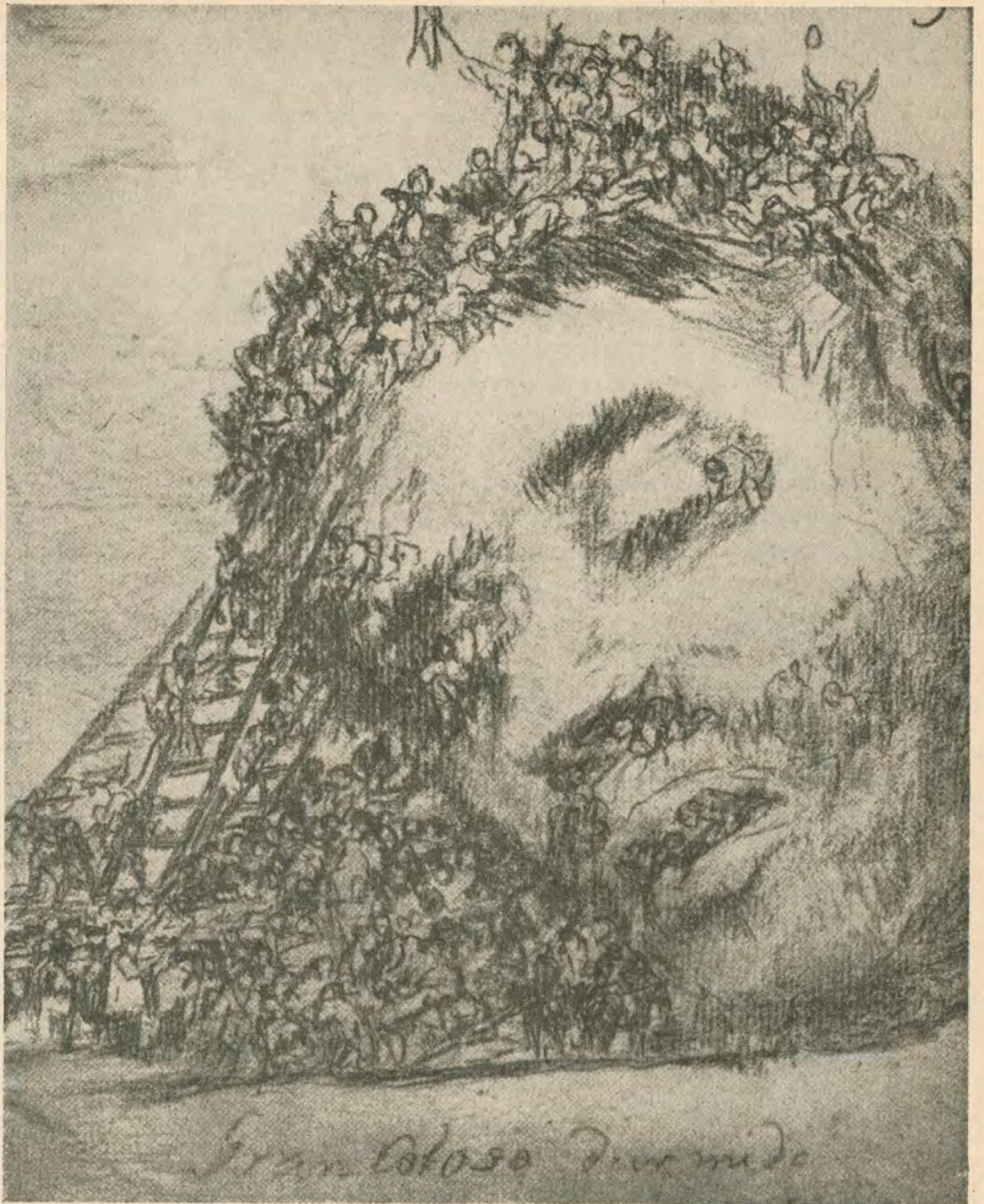
GREAT, SLEEPING COLOSSUS