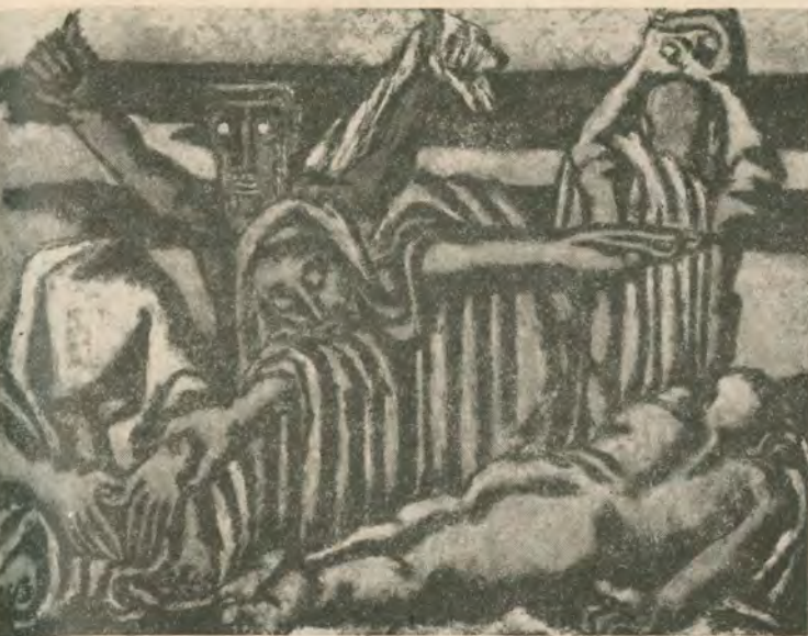
GROUP OF PROPHETS