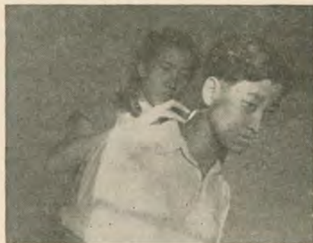
Change of dressing in central clinic is a luxury. Most skin and surface diseases take their course without benefit of care.