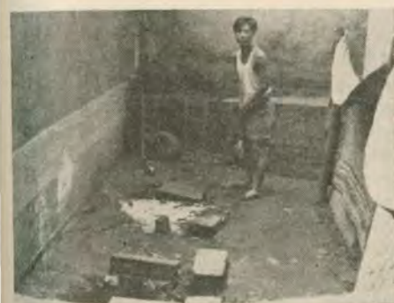
Toilet facilities such as these for a hundred students mean that living standards are pathetically low. Unsanitary conditions are the origin of much of the disease among refugees.

THERE IS NO PLACE in the world where postwar disillusionment could have been worse than in China. For China, having suffered eight years of war with the Japanese, there has been an almost chaotic fate—civil war. For the hundreds of engineering and agricultural students who spent the war years in America, preparing to rebuild China after the war, the past three disheartening years