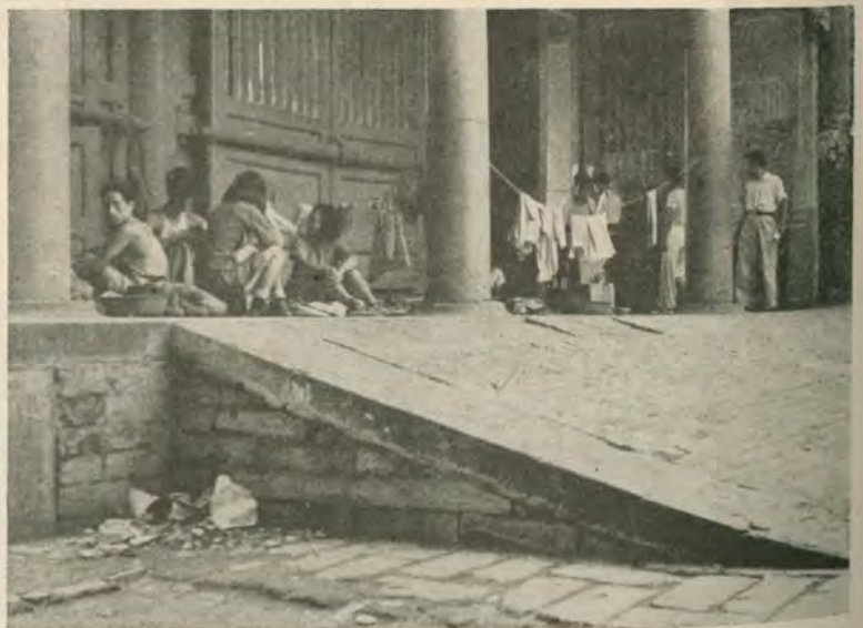
Chinese students found refuge under the wide porches of temples and other public buildings. Open to the elements, these living quarters are demoralizing because of their lack of privacy and of their inadequate protection against vermin, animals and human marauders.