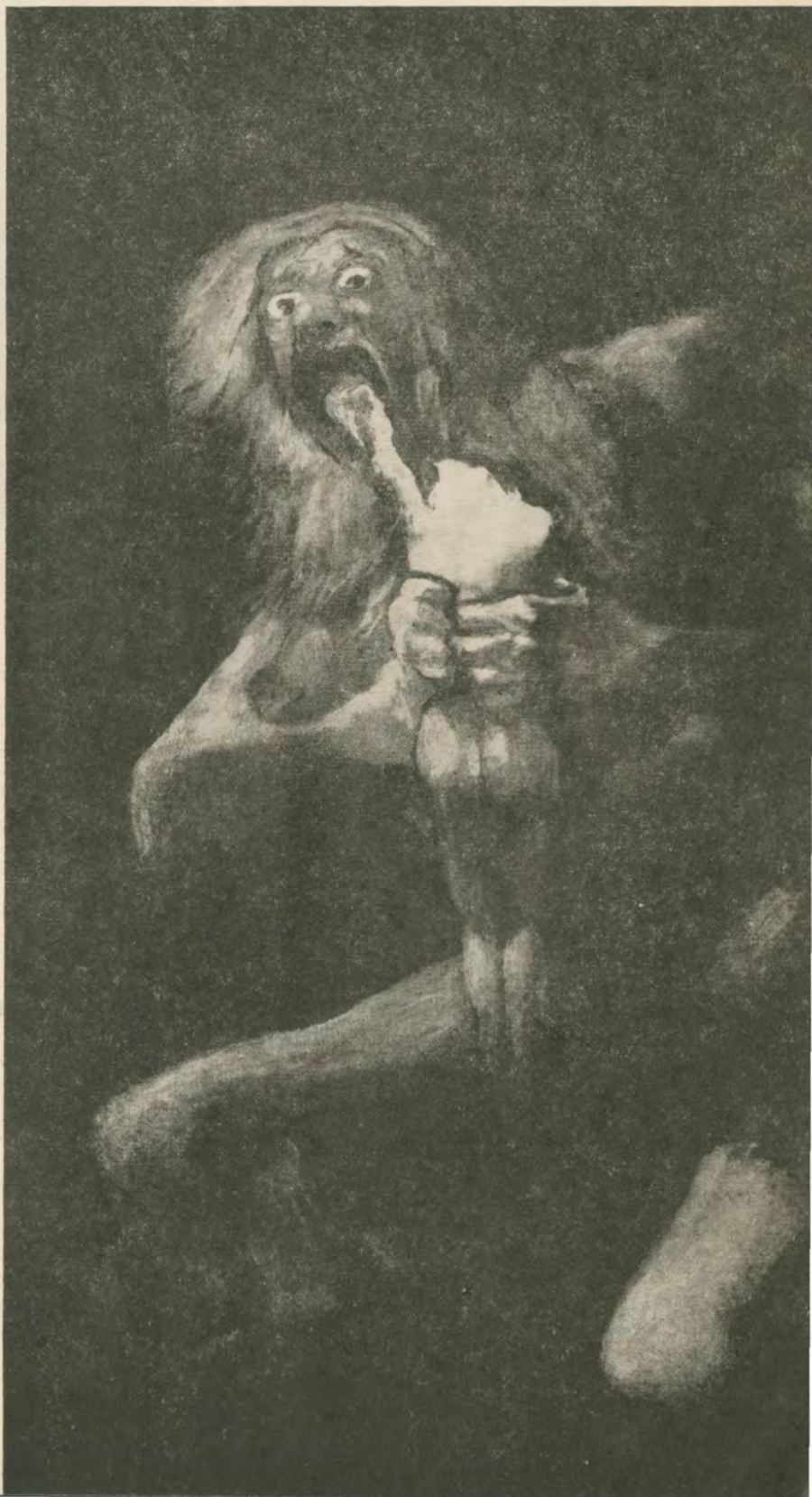
SATAN DEVOURING HIS CHILDREN. Painting by Francisco Goya (Spanish, 1746-1828), Prado Museum, Madrid.

TO POSE SUCH a question is to ask: "What is your idea of life?" For art and life are synonymous. We find among the earliest traces of man evidences of his art. The arts are languages of expression and give voice in creative terms to the emotions, the fears, the aspirations, theories, philosophies, religions and infinite preoccupations of man. Is it a wonder, then, that there is so much variety in the creative arts?