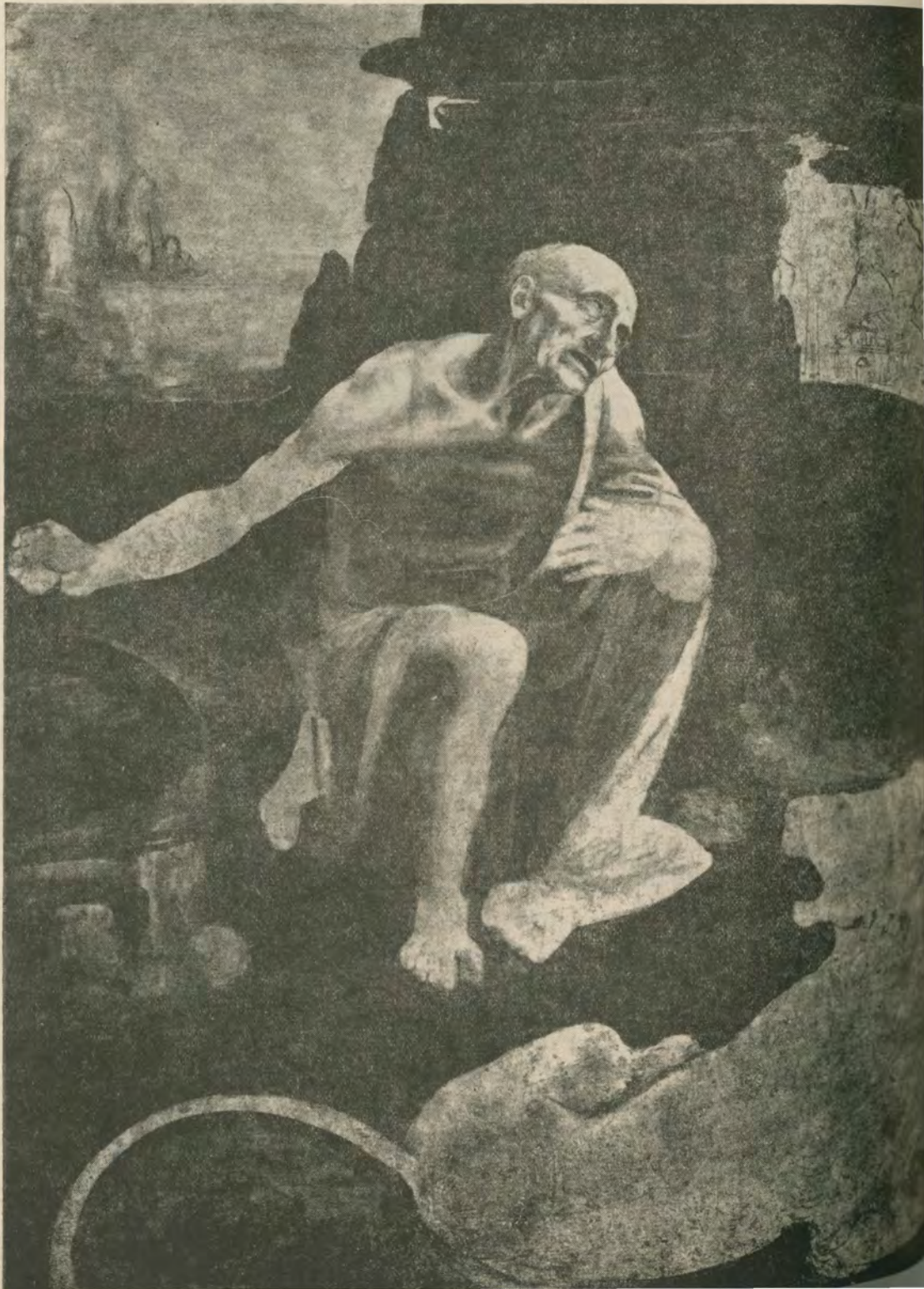
(Right) SAINT JEROME. Painting by Leonardo da Vinci (Italian, 1452-1519), Vatican Museum, Rome.