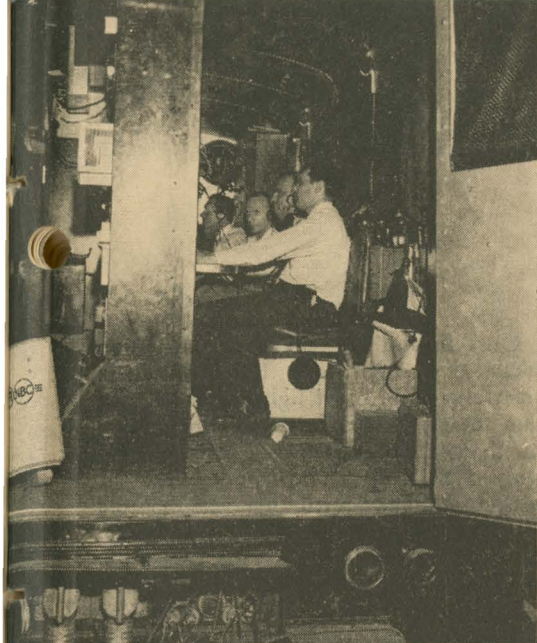
Interior control room unit of NBC's mobile television station