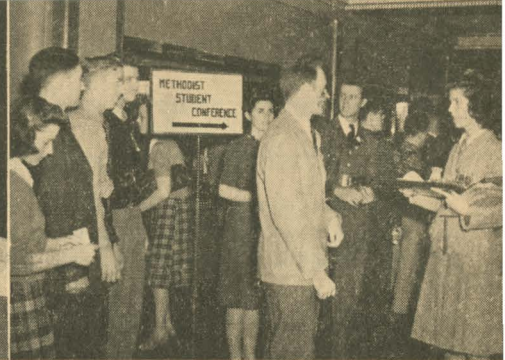
Familiar to students at the National Methodist Student Conference was the Wesley Foundation Building at Urbana which served as headquarters, and The Ilini Union Building where they talked and ate. The Dramatic Summary at the close reminded students again of the co-operation between the Board of Missions and the Board of Education in sponsoring the Conference.

This is only saying that the best way to meet a pagan world is to confront it with a thorough-going Christian way of life. Take the service motive and apply it relentlessly to every vocation and every profession and the start will be made toward a better world.