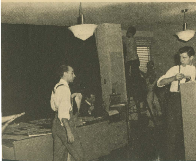
Drape blackouts in the CBS-KNX news bureau, Hollywood.