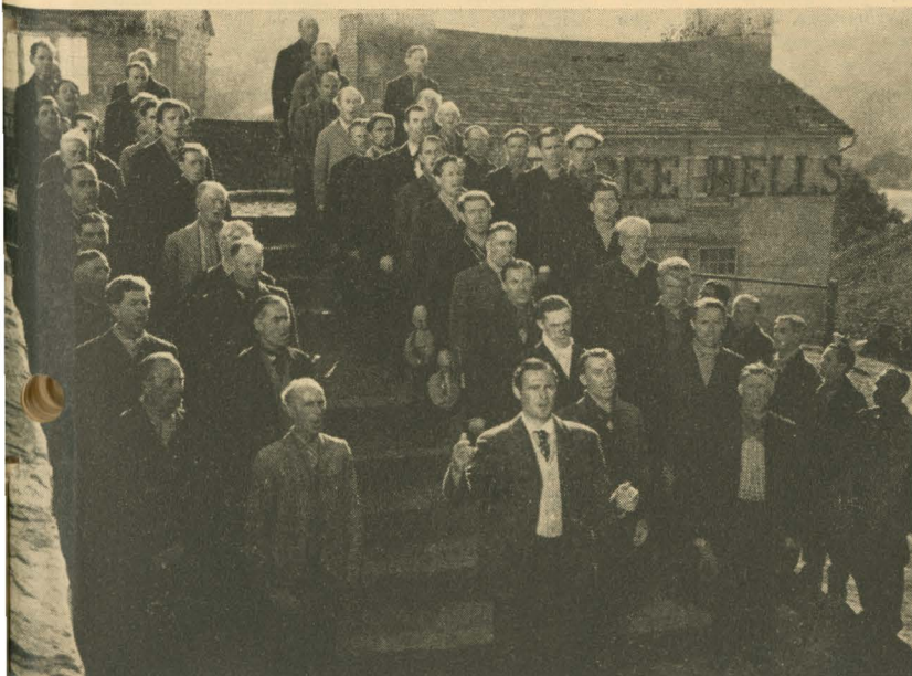
The Welsh Choir whose singing has a real and effective part in How Green Was My Valley .